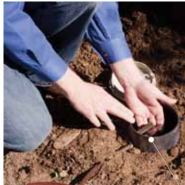
Manual Flush Valve