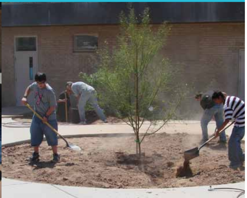
Students working together to install a tree ring and plant a tree.

With the area cleared of asphalt and trenches dug, the adult and student volunteers were ready to install the dripperline in the 107 degree heat. Working from early morning until the project was completed, Hall and the students placed the Techline CV rings in the beds and planted the trees and shrubs.