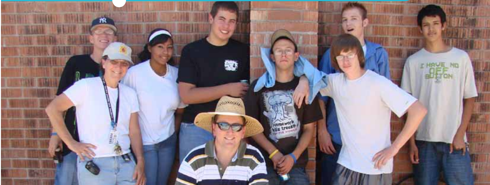
Howenstine High Landscape Project Crew